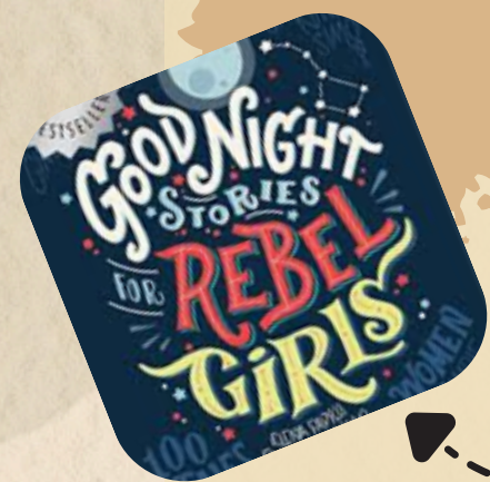
This Term's Books!

In guided reading, we will follow our pathways to read curriculum which begins by studying the book 'Good Night stories for rebel girls'. In Autumn 2, we will read 'Hansel and Gretel' by Neil Gaiman and Lorenzo Mattotti.