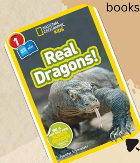
This Term's Books!

We will then look at a non-fiction book based called 'Real Dragons' to introduce non-fiction books that are structured in different ways